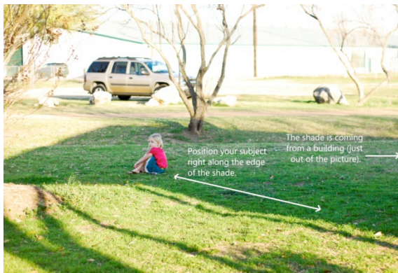
View pulled back to show the open shade.

When looking for a place to take pictures try to look for open shade. When I say open shade I mean look for a place to put your subject that is shaded without splotches of sun peeking through. You especially don't want to have sun splotches on your subject's face. Once you have found your open shade, position your subject just on the edge of the shade to get the best lighting. See examples below: