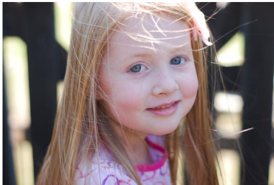
Subject is not facing the light source causing her eyes to look dull and lifeless.

As a rule I always try to position my subject toward the light source. This can be the sun or even a wall reflecting the sun. By doing this you get the eyes to sparkle. This is called creating a catch light in their eyes. Often the subject's eyes will look lifeless and drab if they're not facing a light source. See examples below: