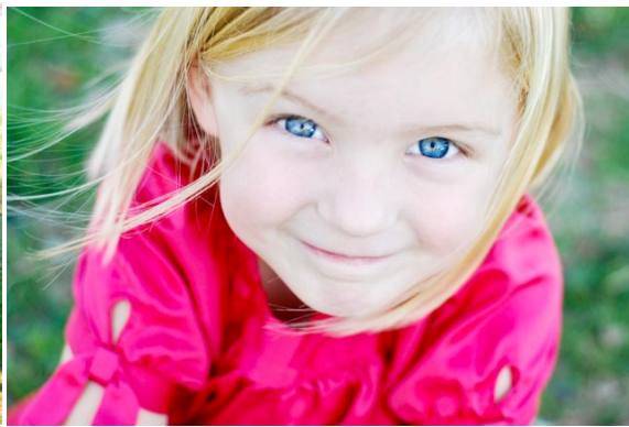
Notice the nice even lighting on her face. 50mm, f2.8, 1/500 th , 400 ISO

As a rule I always try to position my subject toward the light source. This can be the sun or even a wall reflecting the sun. By doing this you get the eyes to sparkle. This is called creating a catch light in their eyes. Often the subject's eyes will look lifeless and drab if they're not facing a light source. See examples below: